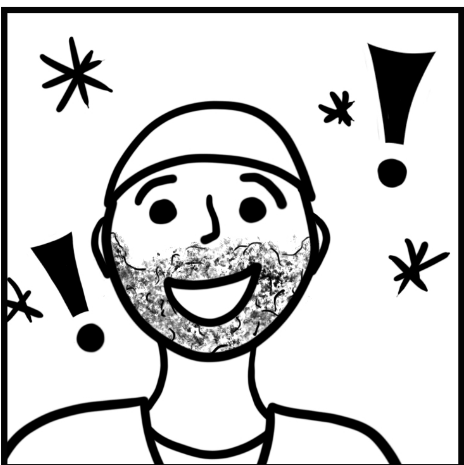
_____ could see again! [usla]