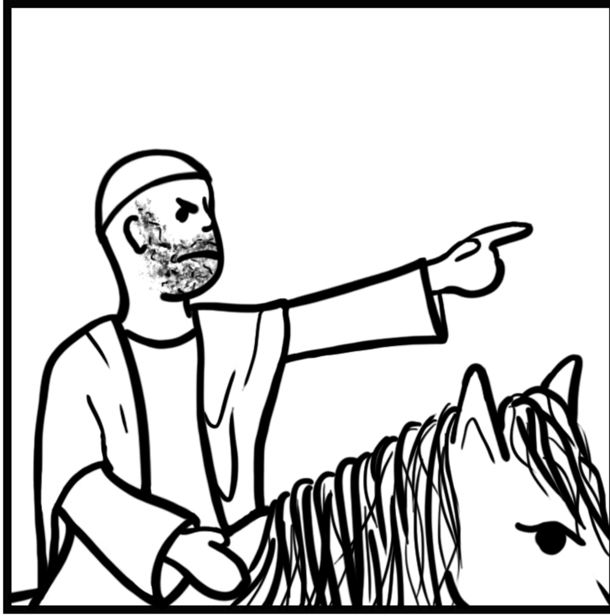
He went to Damascus to _____ the Christians there. [arrtse]