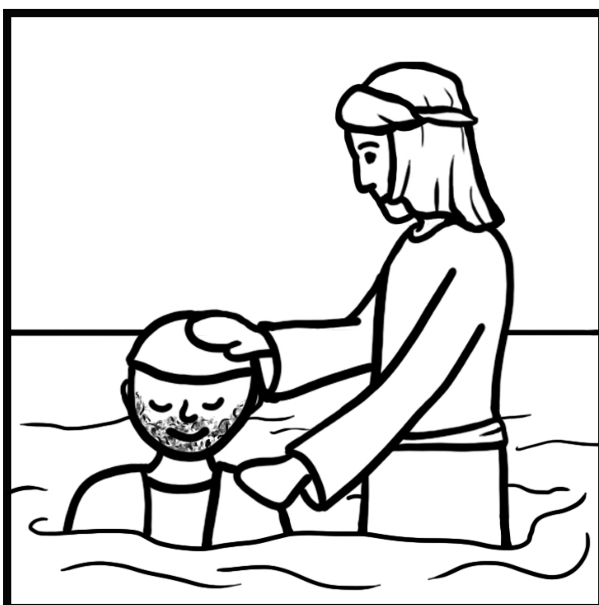
Saul was then _____. [bapdiste]