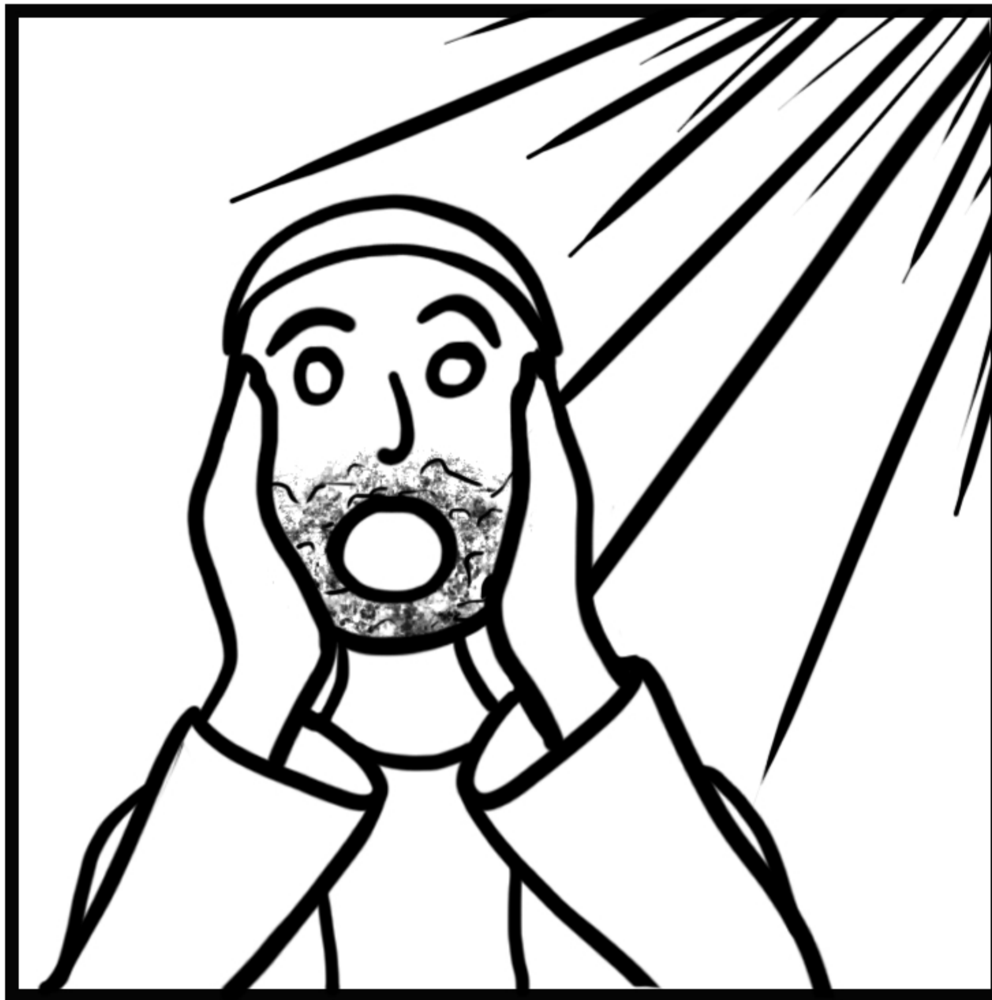
"I am _____!" Saul heard the voice and was shocked!