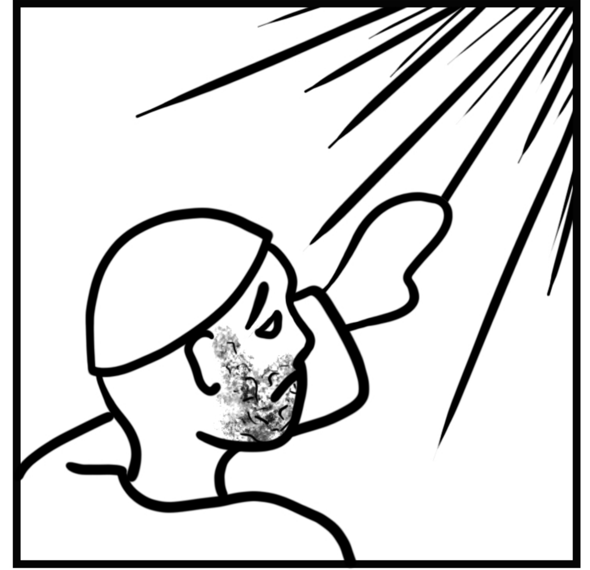
A _____ blinded him! "Saul, Saul, why are you attacking me?" [litgh]