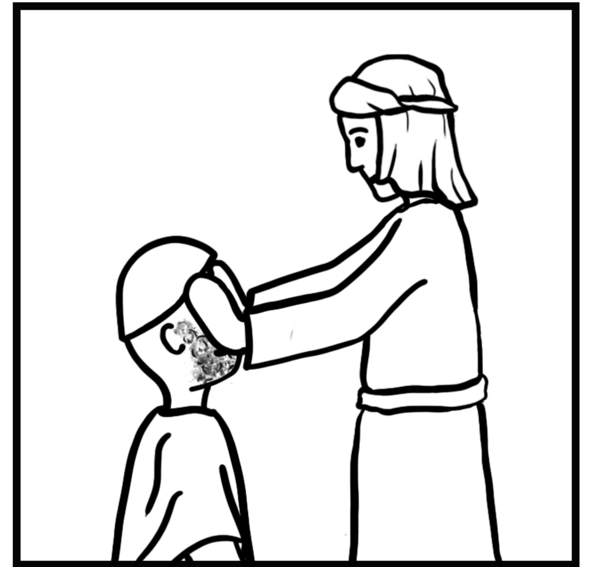
God sent Ananias so that Saul might _____. [ese aniaq]