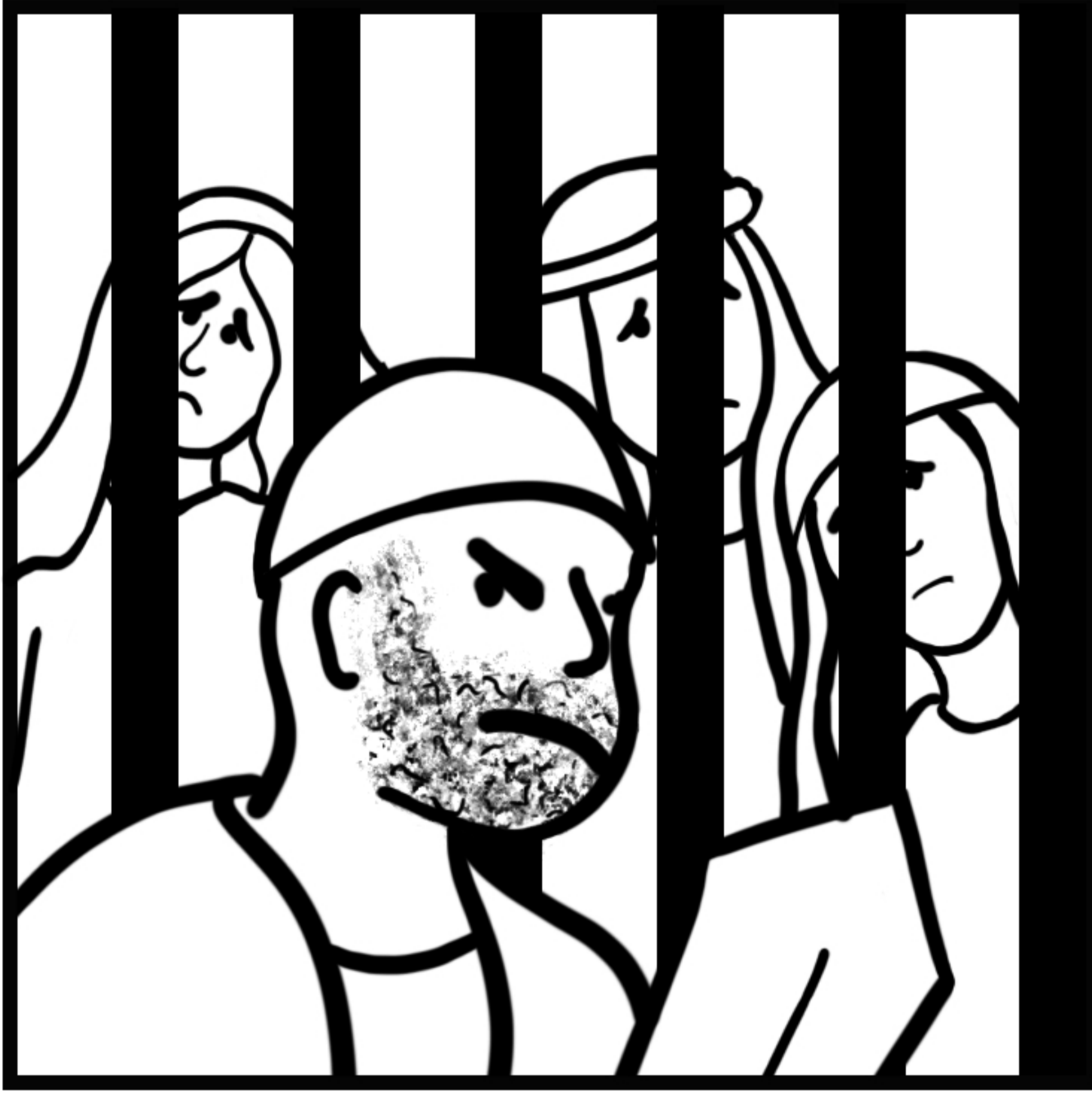
_____ hated Christians! [lasu]

Unscramble the letters and colour the pictures to finish the story.